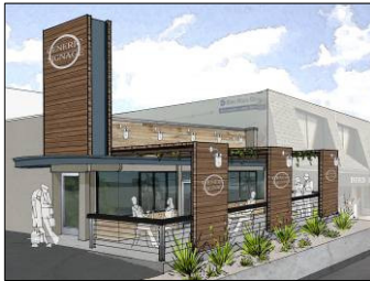
Sidewalk cafe concept