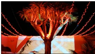
Lighting a festive atmosphere