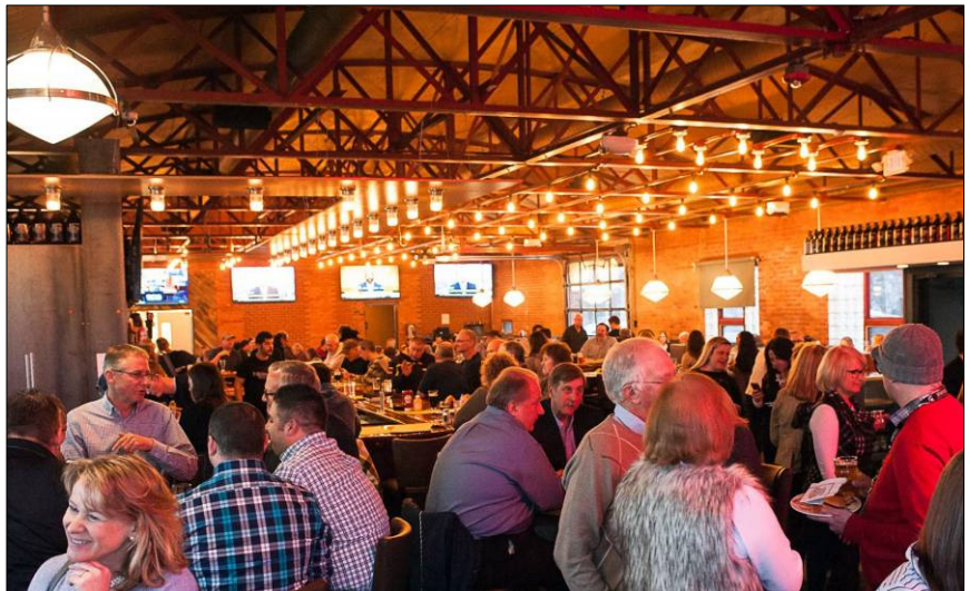
One cohesive space divides easily into three more intimate spaces including a lounge from which the photo was taken

We designed a large central U-shaped bar to subdivide the space into three distinct areas. These areas provide varying degrees of autonomy for special events but maintain the cohesiveness of the space and the character of the century-old industrial building.