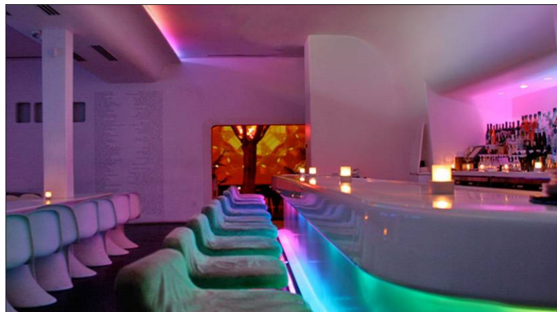
The intimate bar contrasts with the boisterous courtyard

This was a rich and complex project with a variety of indoor/outdoor transitions, level changes, and distinct moods. It opened in record time to long lines, and was one of our most enjoyable projects!