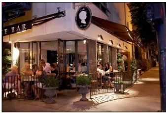
Old world sidewalk cafe