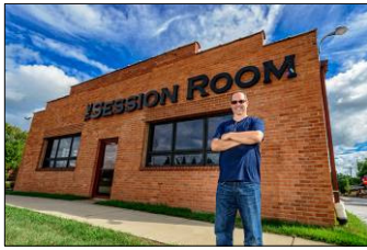
Asymmetrical signage inflected to entrance at side