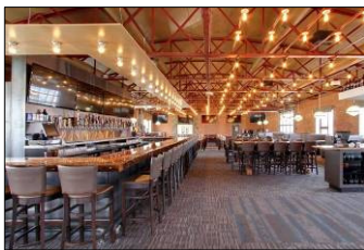
A central bar divides space