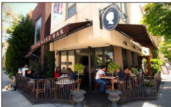
The sidewalk cafe engages it's urban surroundings