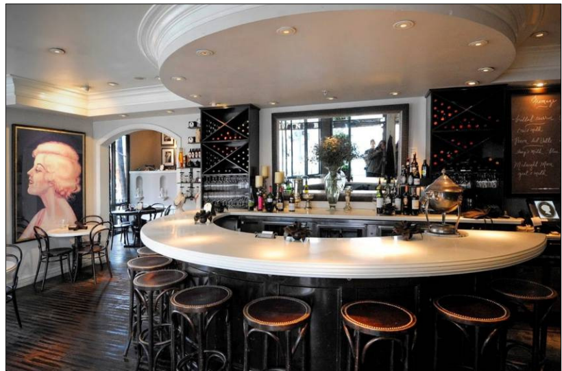
The building's quirky plan provided opportunities for unique, concept-driven spaces

We handled all the problem solving and permitting while the owners attended to the rest of the design and detailing. It was gratifying to help these passionate people see their ideas come to life.