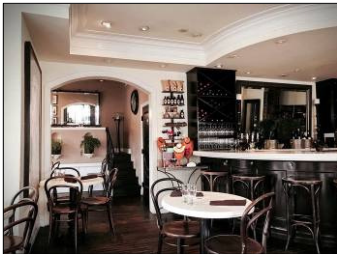
We embraced level changes for cozy spaces