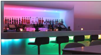
Setting the mood