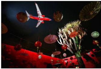
Jets above animate the courtyard