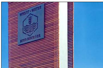
Natural materials reinforce the farm to table ethos